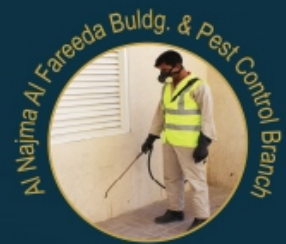
Al Najma Al Fareeda Buldg. & Pest Control Branch