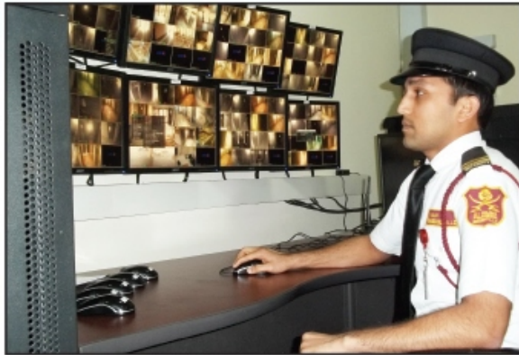
► Security Control Room