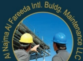
Al Najma Al Fareeda Intl. Buldg. Maintenance LLC