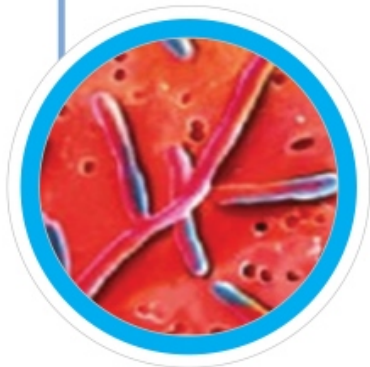
Water Tank Bacteria