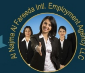
Al Najma Al Fareeda Intl. Employment Agency LLC