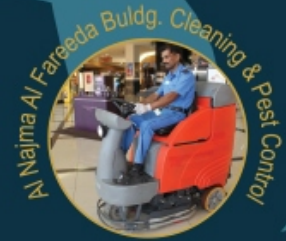
Al Najma Al Fareeda Buldg. Cleaning & Pest Control