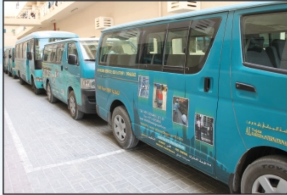
► Our Transportation