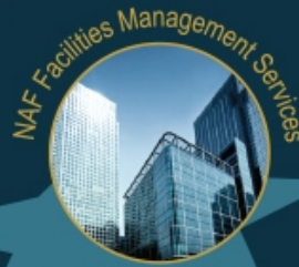
NAF Facilities Management Services