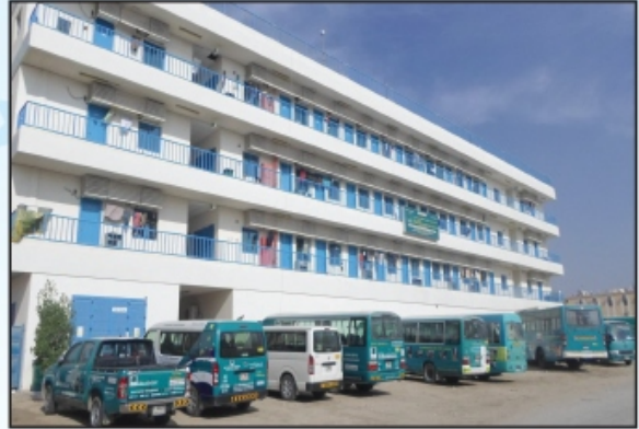
► Our Labor Camp