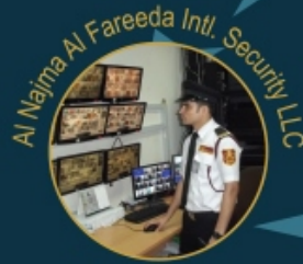
Al Najma Al Fareeda Intl. Security LLC