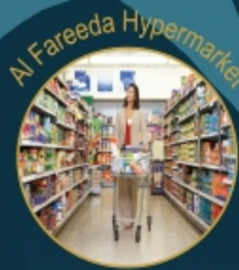
Al Fareeda Hypermarket